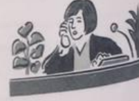
12 reception _____