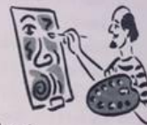
2 art _____