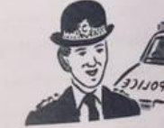
10 police _____