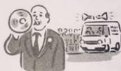
5 politics _____