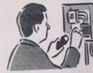
8 electric _____