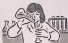
3 science _____