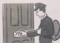
11 post _____