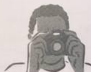
9 photograph _____