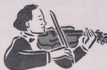
1 music musician