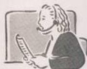
7 interpret _____