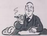
6 manage _____