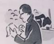
4 journal _____