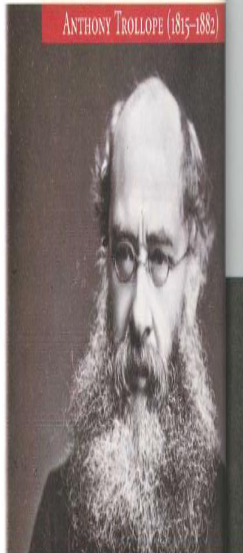
ANTHONY TROLLOPE (1815–1882)

4 ____ has been married twice, and has two daughters. ____ married for the first time in 1966. ____ was