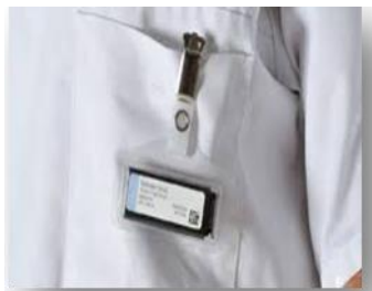
Optically Stimulated luminescent (OSL) dosimeter