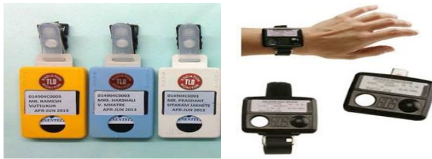
Thermo-luminescent dosimeter (TLD)