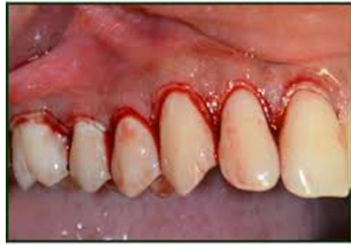
Fig 2: Inverse bevel incision on buccal side

The scalloped incision is performed on both labial and palatal aspects, using the double-edge 12B scalpel. It is an inverse bevel incision extending to the alveolar crest. This incision thins the gingival tissue and permits complete closure of the interdental osseous defects postoperatively. The distance of the incision from the gingival margin may vary from 0.5 to 2mm.