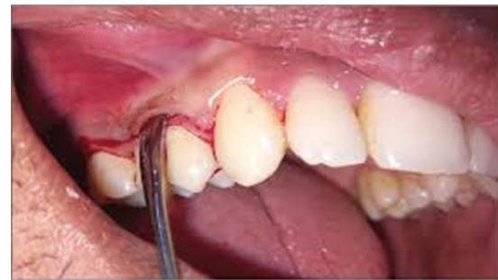
Figure 3: Internal bevel incision given – Group 1

B: Flap reflection An elevator is used to raise a full thickness mucoperiosteal flap . The flap is reflected only to permit direct visualization of the root surface and the alveolar crest. In most cases it is possible to stay within the boundaries of the attached gingiva, without extending beyond the mucogingival line.