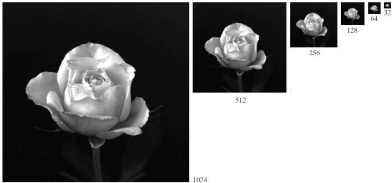
Figure : A 1024 \times 1024 , 8-bit image Subsampled down to size 32 \times 32 pixels.

To demonstrate the checkerboard pattern effect, we subsample the 1024 \times 1024 image shown in Figure (1) to obtain the image of size 512 \times 512 pixels. The 512 \times 512 is then subsampled to 256 \times 256 image, and so on until 32 \times 32 image. The subsampling process means deleting the appropriate number of rows and columns from the original image. The number of allowed gray levels was kept at 256 in all the images.