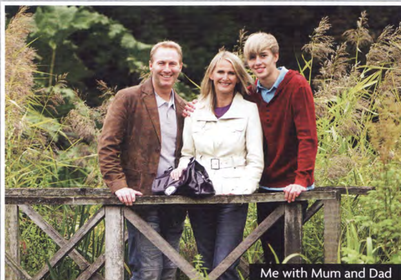
Me with Mum and Dad