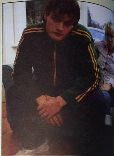
'My husband's been wasting money on computer games.'