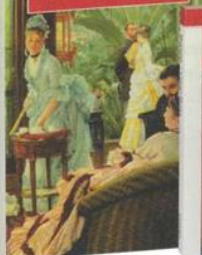
ANTHONY TROLLOPE PHINEAS FINN