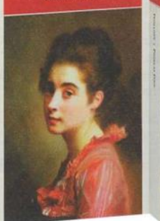
ANTHONY TROLLOPE RACHEL RAY