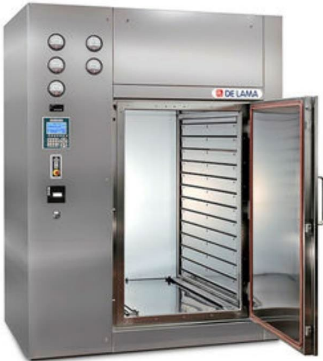
Figure 1: shows Oven device