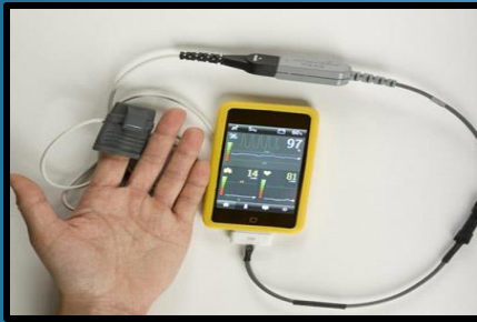
Monitor blood oxygen levels

Bio-sensor (monitor blood oxygen levels, glucose sensor, skin analysis sensor, breath analysis sensor, enzyme based sensor, etc.