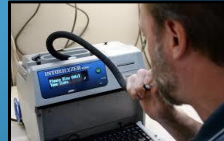
Breath analysis sensor