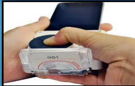
Enzyme based sensor