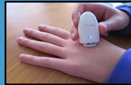
Skin analysis sensor