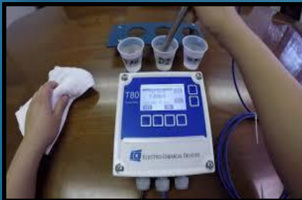
Electro analytical sensor