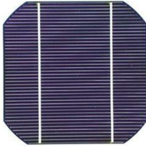
Figure (1) photovoltaic cell