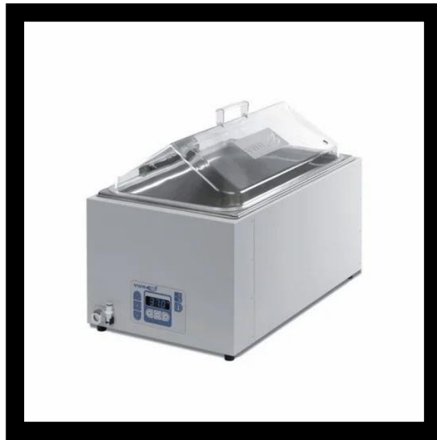
Figure(5) Water Bath

A laboratory water bath can heat substances slowly and keep that temperature for a long time, as long as you keep the switch on. You can also use it to heat flammable substances that one just can't hold over a burner. They come in various capacities and capabilities such as circulating water baths or shaking water baths.