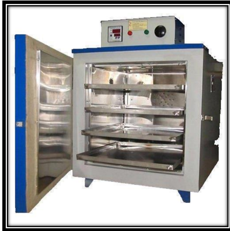
Figure(6) Hot Air Oven

survive that kind of heat for a sustained time. An autoclave heats up plain air in a heating chamber and circulates it in the chamber, assaulting any living organism and oxidizing them into inertness.