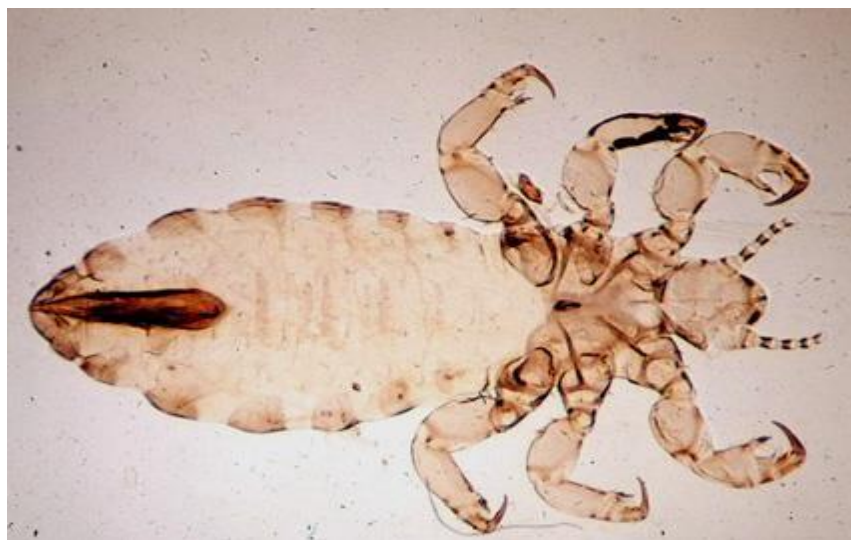
Pediculus humanus capitis (male) as an example of ectoparasites.

Many ectoparasites are known to be vectors of pathogens, which the parasites typically transmit to host while feeding