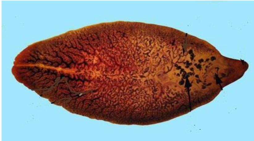
A Trematode worm, Fasciola hepatica

Endoparasites and Ectoparasites. Endoparasites are sub-classified into Helminthic parasites (multicellular organisms) and Protozoan parasites (unicellular organisms. Helminthic parasites are either flat worms (Trematodes), segmented worms (Cestodes) or cylindrical worms (Nematodes).