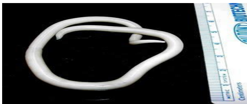
A Nematode worm, Ascaris lumbricoides