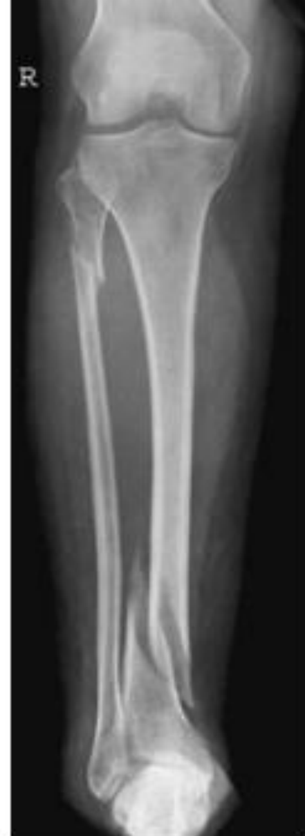
Antero-posterior radiograph showing fracture of proximal fibula and distal tibia