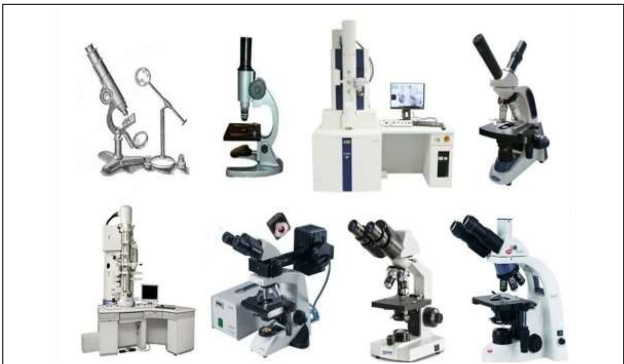
Types of microscopes