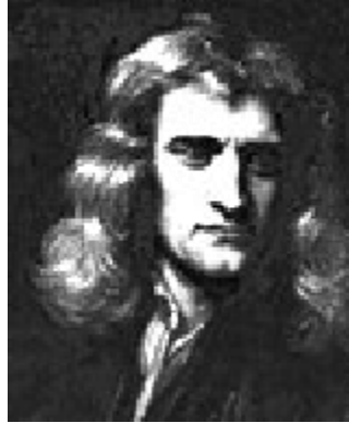
Figure 7.1: I do not know what I may appear to the world; but to myself I seem to have been only like a boy playing on the sea-shore, and diverting myself in now and then finding a smoother pebble or a prettier shell than ordinary, whilst the great ocean of truth lay all undiscovered before me. Isaac Newton .

If the particle has a velocity ( \mathbf{u} ) with components (u_1, u_2, u_3) in \mathcal{O} , its velocity in \mathcal{O}' is: