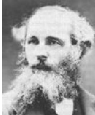
Figure 7.2: James Clerk Maxwell

These equations show that one can have electromagnetic waves in a vacuum which travel with a speed c = 3 \times 10^8 m/s, thus light is a form of electromagnetic radiation.